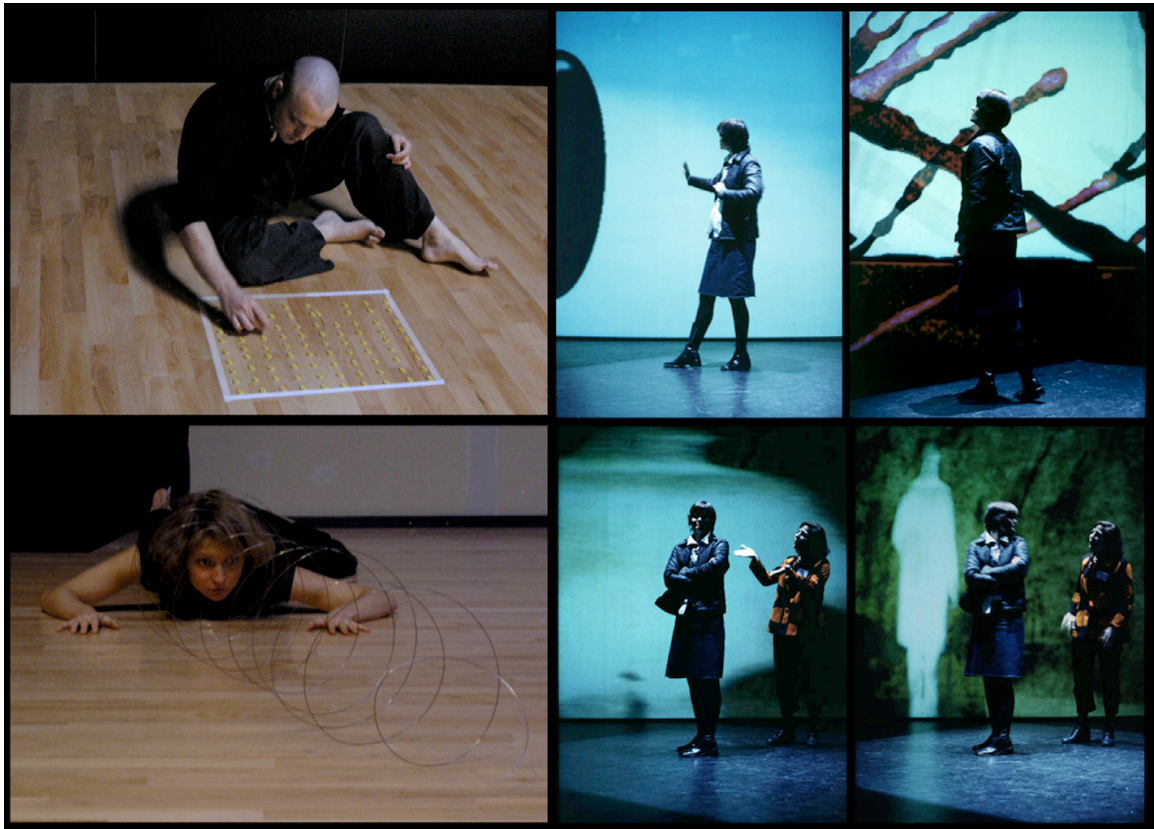
Figure 3 Work with physical and virtual objects. The RespOnce project (left) and the PAToolbox project (right).